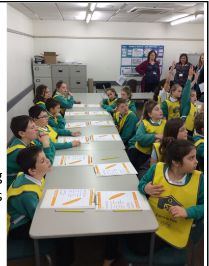
A year 5 class hard at work